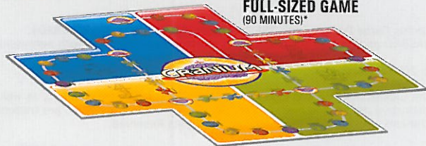
FULL-SIZED GAME (90 MINUTES)*

*This is our best guess. Actual game times may vary depending on providence, adequate and/or distracting snacks, and the overall brilliance of the players.